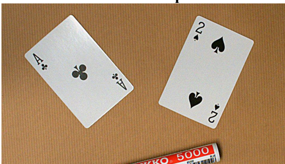
Basic scene example